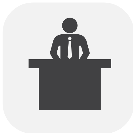
Workshops/ Seminars & Awareness Campaigns