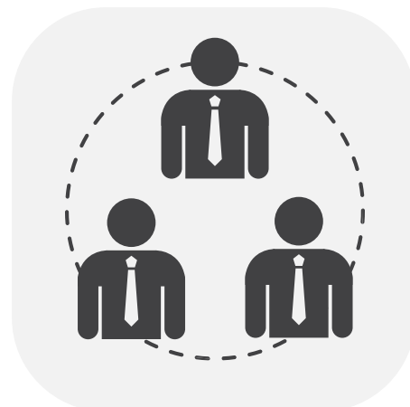
Vendor Development Programmes (VDPs)