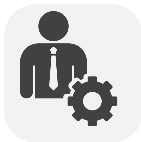
Skill Development Training Programmes